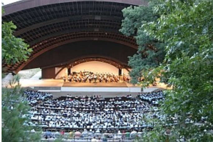
William Stewart Memorial Shell